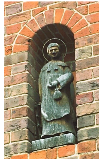
The statue of St Lawrence above the church entrance

The worshipping community's conviction that the people of Eastcote are God's treasure brings with it an impetus for us to enhance our facilities to better meet other's needs and serve our community. The most visible enhancement made is to the church building, which is now a light and uplifting space. AV infrastructure has been installed which makes the building apt to use for public meetings, presentations and performances, as well as worship.